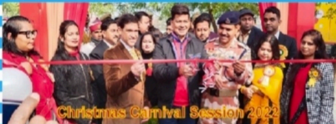
Christmas Carnival Session 2022