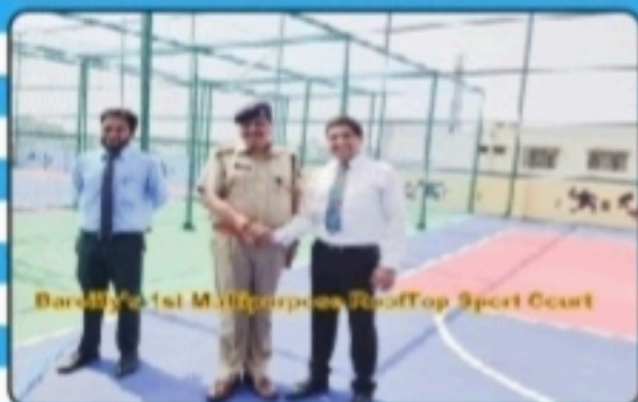
Bardoli's 1st Multi-Purpose Roo-Top Sport Court